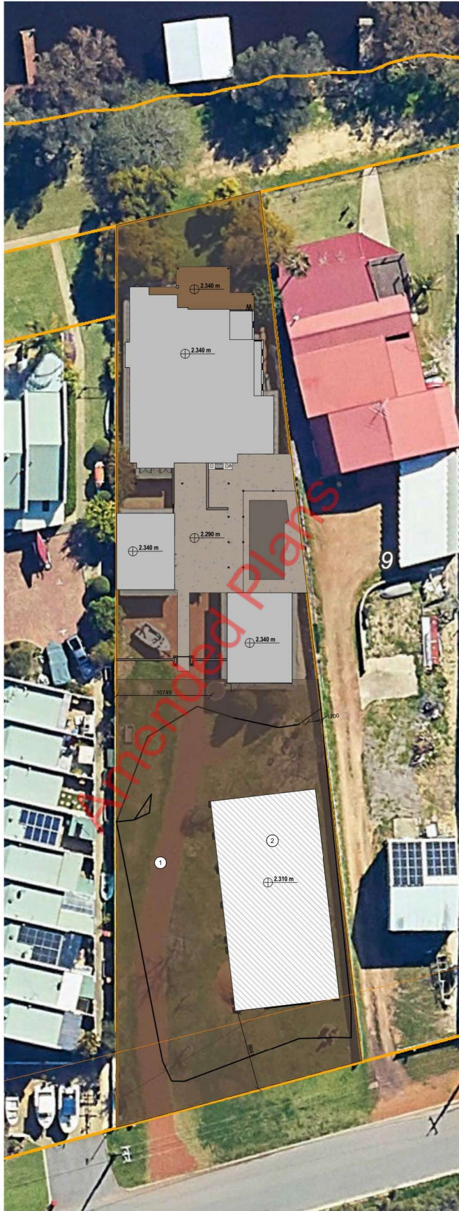
SITE PLAN 1 : 300

NOTES-DESIGN CRITERIA R-CODE/ZONE: R12.5 SITE AREA: 2276m 2 EXISTING BUILDINGS: DWELLING/GARAGES SITE CLASSIFICATION: SEE ENGINEER NOTES PARKING: 2+ CLIMATE ZONE: 5 BUSHFIRE PRONE AREA: YES FLOOD PRONE AREA: YES WIND CLASSIFICATION: SEE ENGINEER NOTES CORROSION ENVIRONMENT(DURABILITY): SEE ENGINEER NOTES STORMWATER: SEE NOTES FOR FURTHER INFORMATION REFER SEPARATE SITE REPORT BY THIRD PARTY CONSULTANT