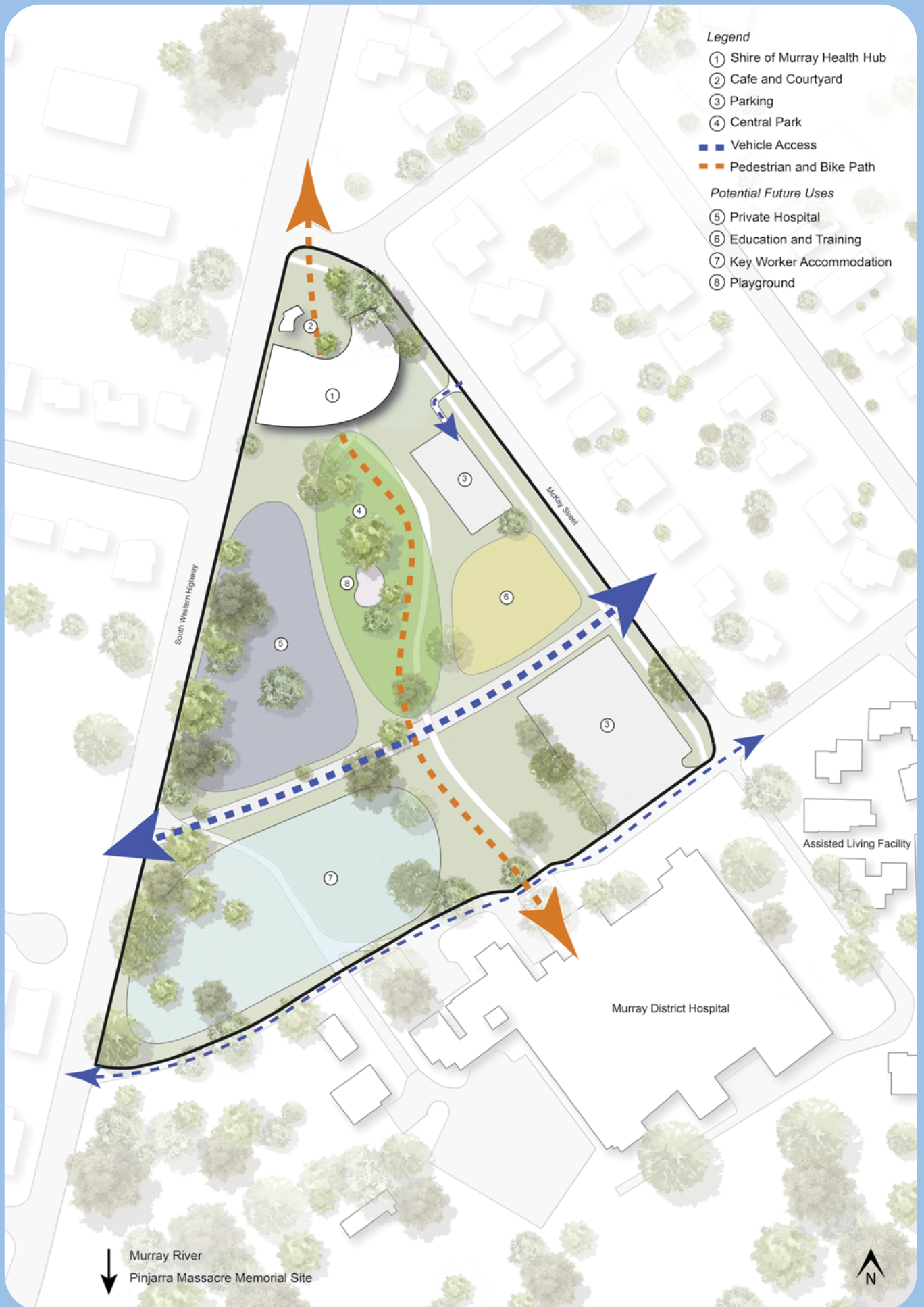
Figure 1: Preferred Site - Potential Uses.