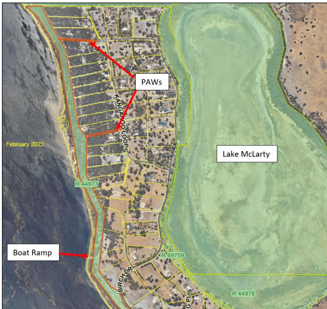
2. Location Plan