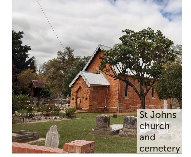
St Johns church and cemetery