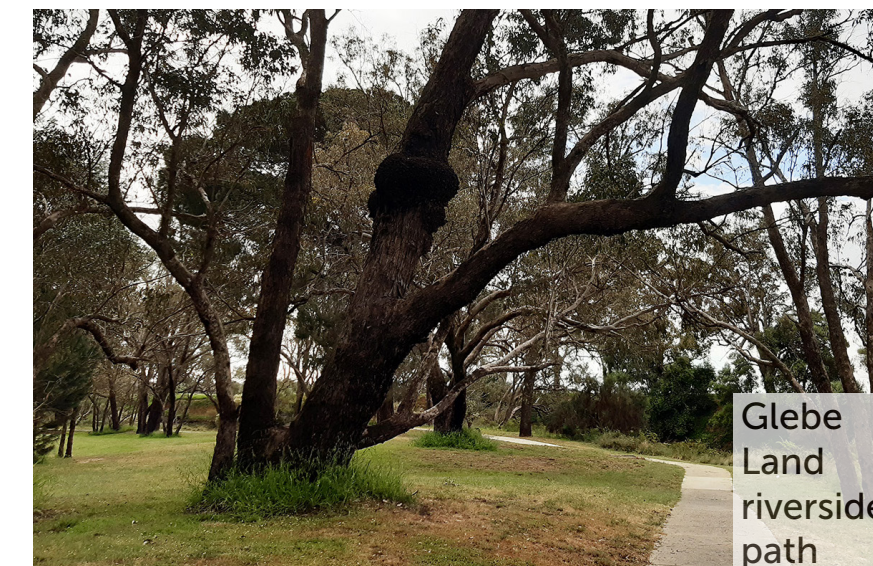
Glebe Land riverside path