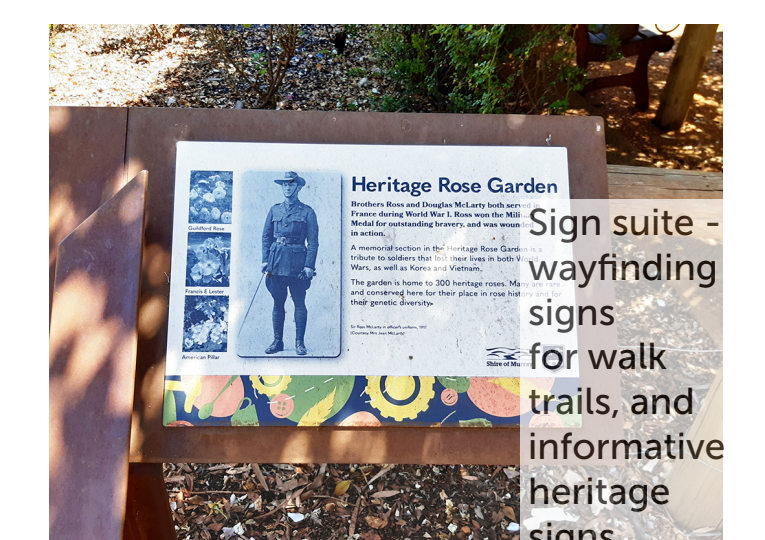
Sign suite - wayfinding signs for walk trails, and informative heritage signs