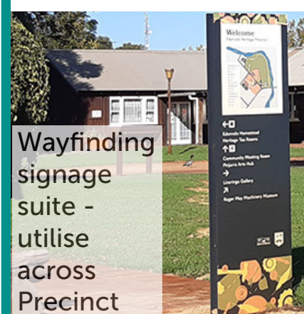
Wayfinding signage suite - utilise across Precinct