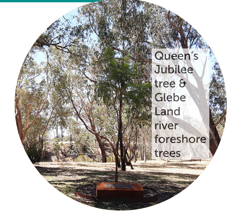
Queen's Jubilee tree & Glebe Land river foreshore trees