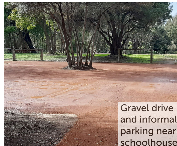
Gravel drive and informal parking near schoolhouse