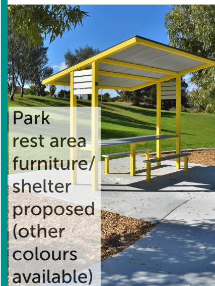
Park rest area furniture/ shelter proposed (other colours available)