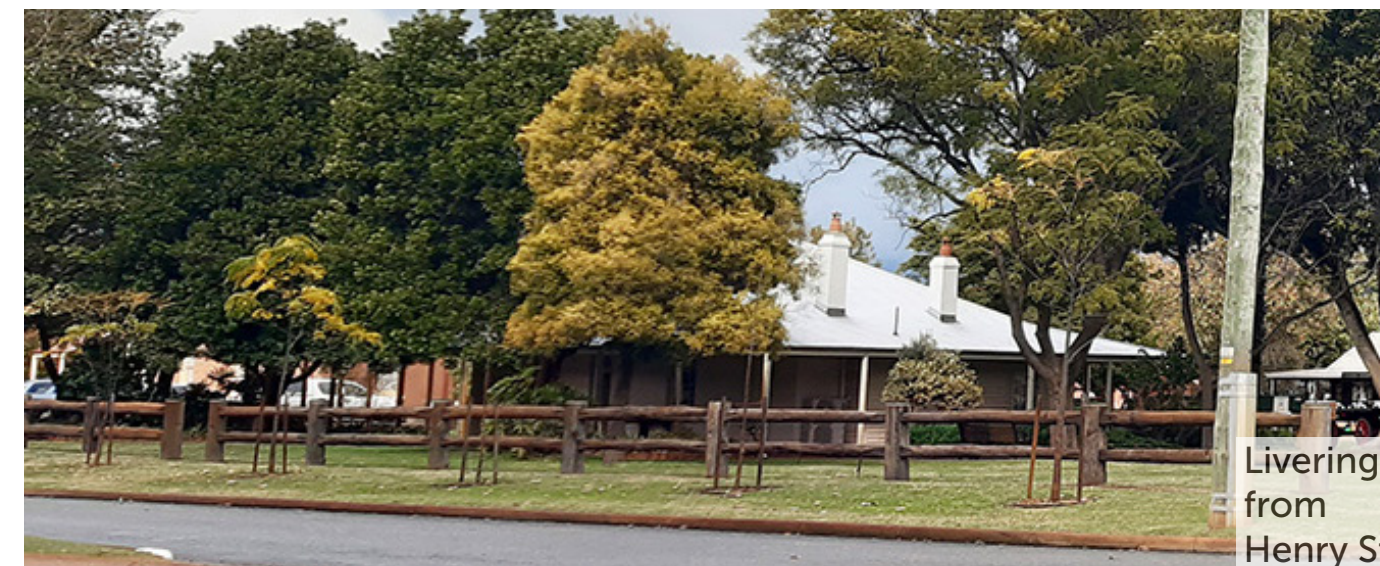
Liveringa from Henry St