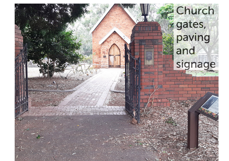
Church gates, paving and signage