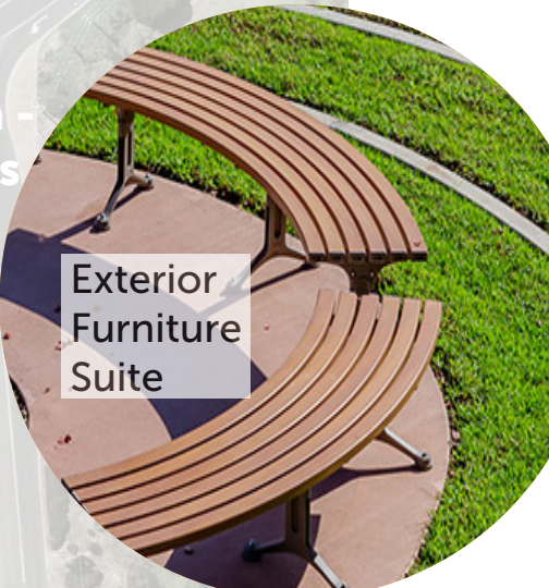
Exterior Furniture Suite