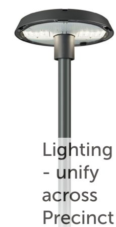
Lighting - unify across Precinct