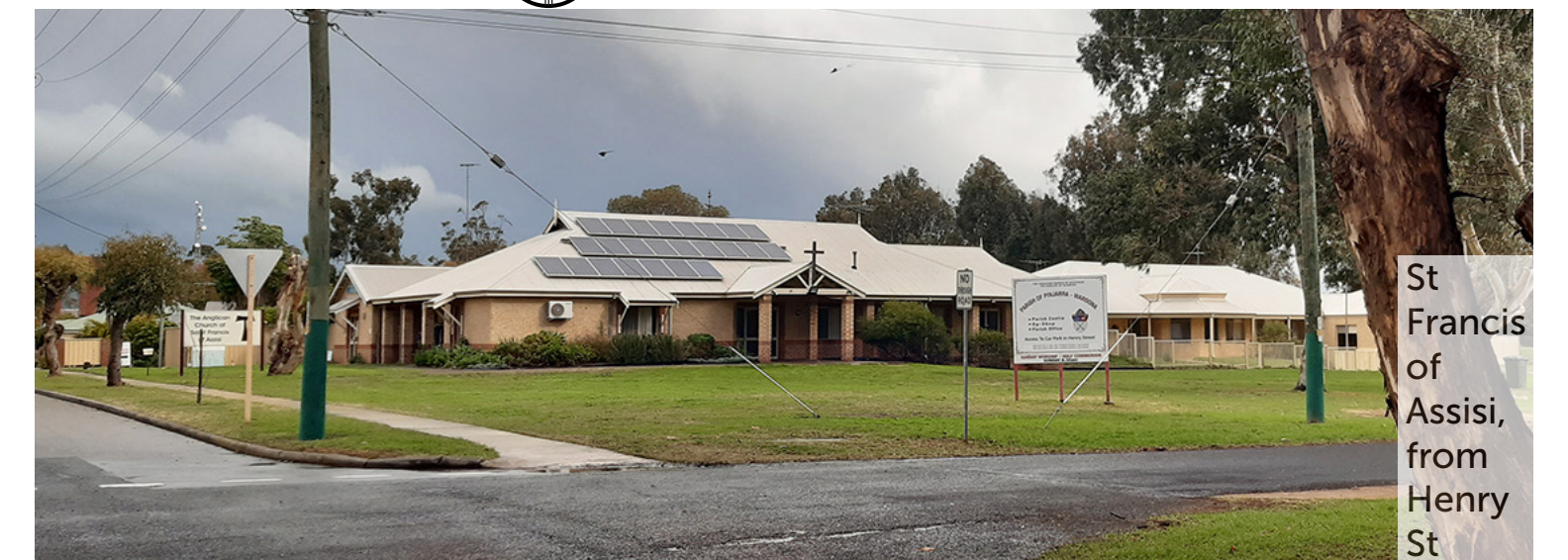
St Francis of Assisi, from Henry St